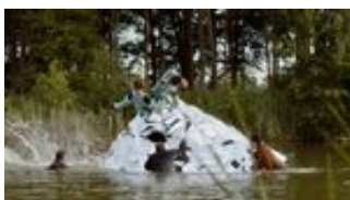
NAIAD_SKYPUNCH COLLECTIVE_foto Kinetic Film_Bosch Parade 2022_2.jpeg