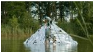
NAIAD_SKYPUNCH COLLECTIVE_foto Kinetic Film_Bosch Parade 2022_1.jpeg